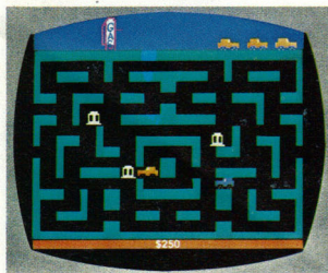
SILVER DOLLAR, SOUTH DAKOTA

The bar on the right side of the gas tank shows the level to which your tank can be refilled WHEN YOU LEAVE TOWN. If the pointer is white, the amount of gas in the tank will be refilled to the height of the bar. If the pointer is red, the gas level in the tank will remain the same. Robbing nine or more banks in a town will enable you to refill the entire tank.