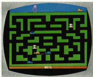
FLAT BROKE, ARKANSAS