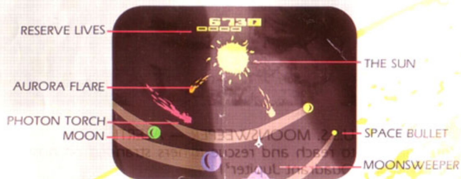
ORBITING TO SELECT MOONS