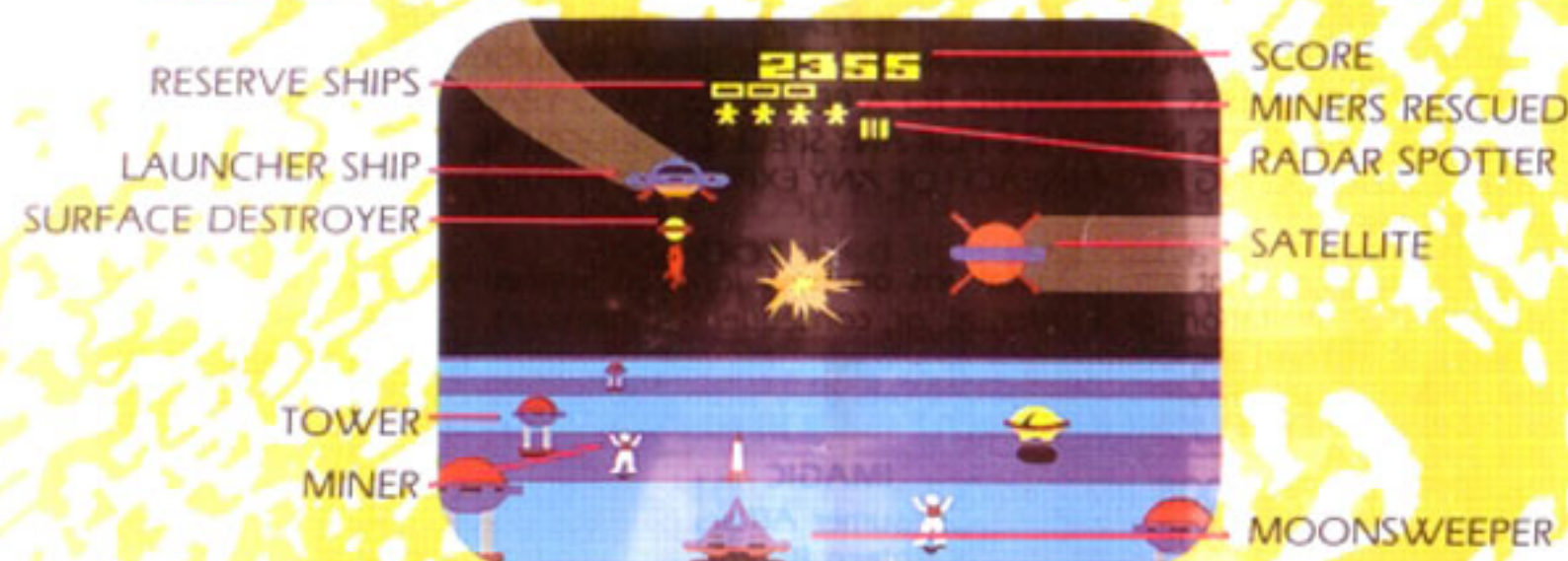
ON A MOON SURFACE

NOTE: ALL THESE OBJECTS MAY NOT APPEAR AT THE SAME TIME