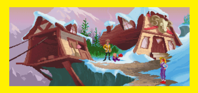
...or clicking around the world.

All of the game playing activities in The Hand Of Fate can be easily controlled by using your mouse. Only the left button is needed. The middle and right buttons are not used in this game.