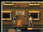
MOTOR CITY SHOW DOWN!